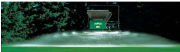
Frequent, light topdressing of 18 greens in 90 minutes.

■ Patented three-position switch guarantees spinners turn on before conveyor, ensuring a clean application every time.