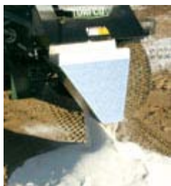
Trench Filler Attachment

A trench filler attachment gives the WideSpin 1530 even more uses—and saves time and labor. Prod. No. 86150