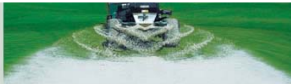
Heavy spread applications up to 15'.